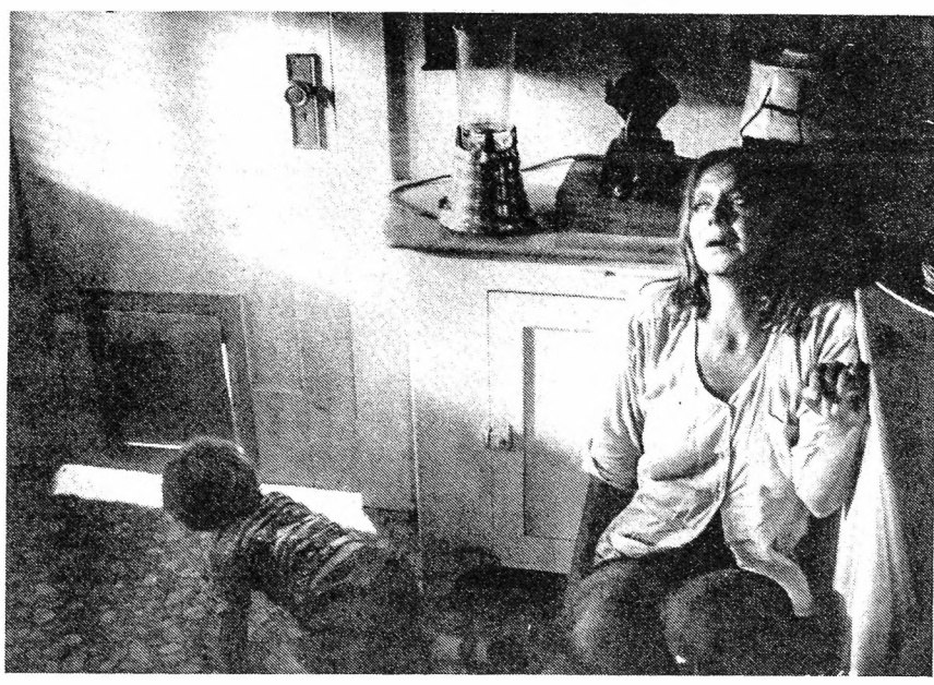
The child (Gary Guffey) drawn on by a strange glow in the sky. Close Encounters of the Third Kind.