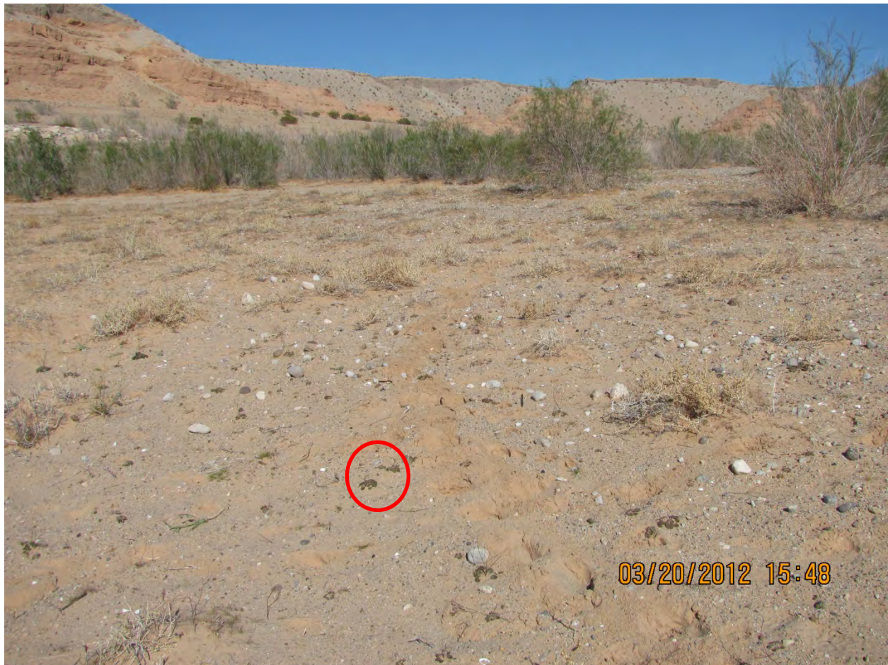
Figure 1. Cattle tracks through a population of sticky buckwheat at Lime Cove. The red circle points out the sticky buckwheat.