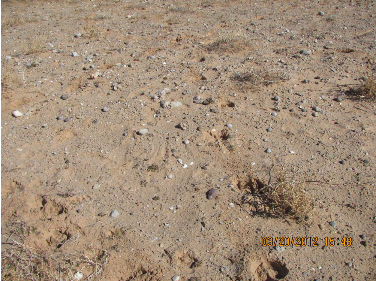
Figure 3. Close-up of cattle footprints among sticky buckwheat plants.