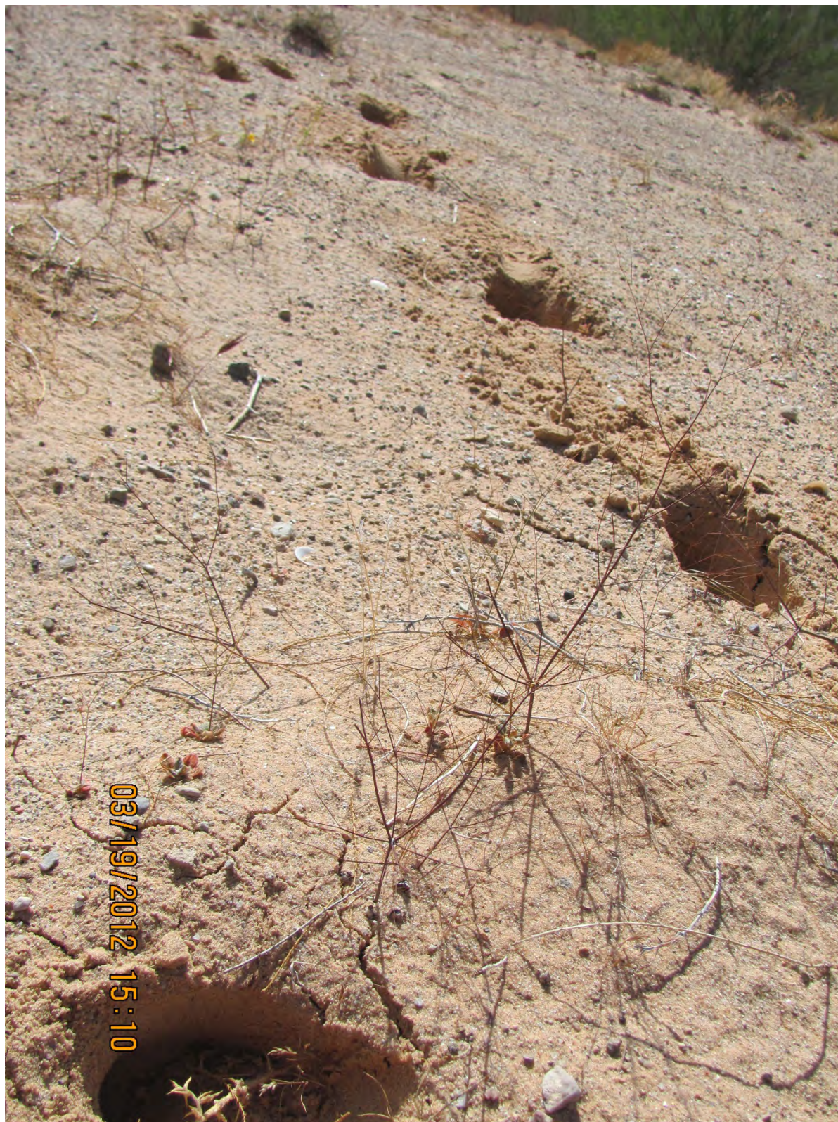
Figure 7. Cattle footprints through sticky buckwheat populations at Lime Cove.