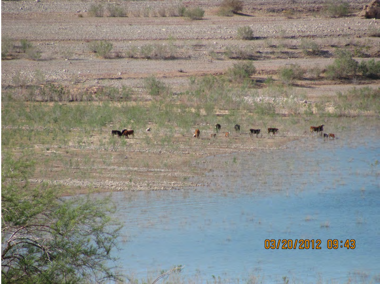
Figure 5. A close up of cattle at Lime Cove.