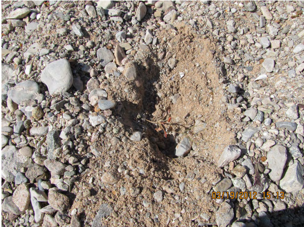
Figure 6. Sticky buckwheat that was stepped on by a cow at Lime Cove.