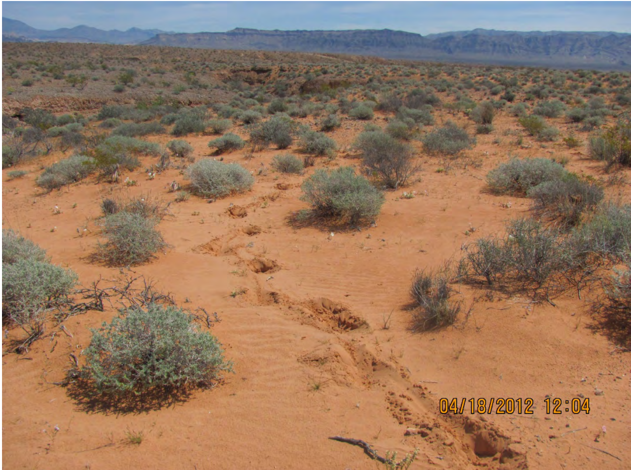
Figure 8. Cattle footprints in sandy habitat along the Valley of Fire powerline road.

The photo in figure 8 is in an area west of Northshore Road along a powerline road. This particular area has many acres of gypsum habitat and some sandy habitat intermixed with sensitive/rare species. Las Vegas bearpoppy and ringstem are located in the gypsum habitat. The sandy habitat has threecorner milkvetch and potentially sticky buckwheat.