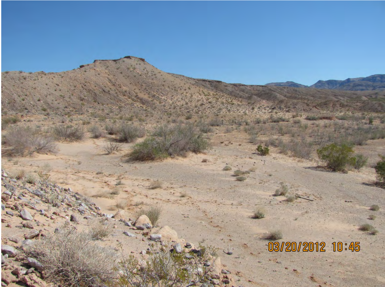
Figure 2. Cattle trails going through sticky buckwheat habitat at Lime Cove.

Sticky buckwheat, Eriogonum viscidulum , grows in sandy areas along the Overton Arm of Lake Mead. Sticky buckwheat is an annual plant which emerges around March and then flowers and sets seed by April to early May. Allowing cattle to roam free in these rare plant habitats could seriously impact the sticky buckwheat population. If the plant is stepped on or is eaten at any stage of its life cycle (actively growing, flowering, or setting seed) this will effect next year's population.