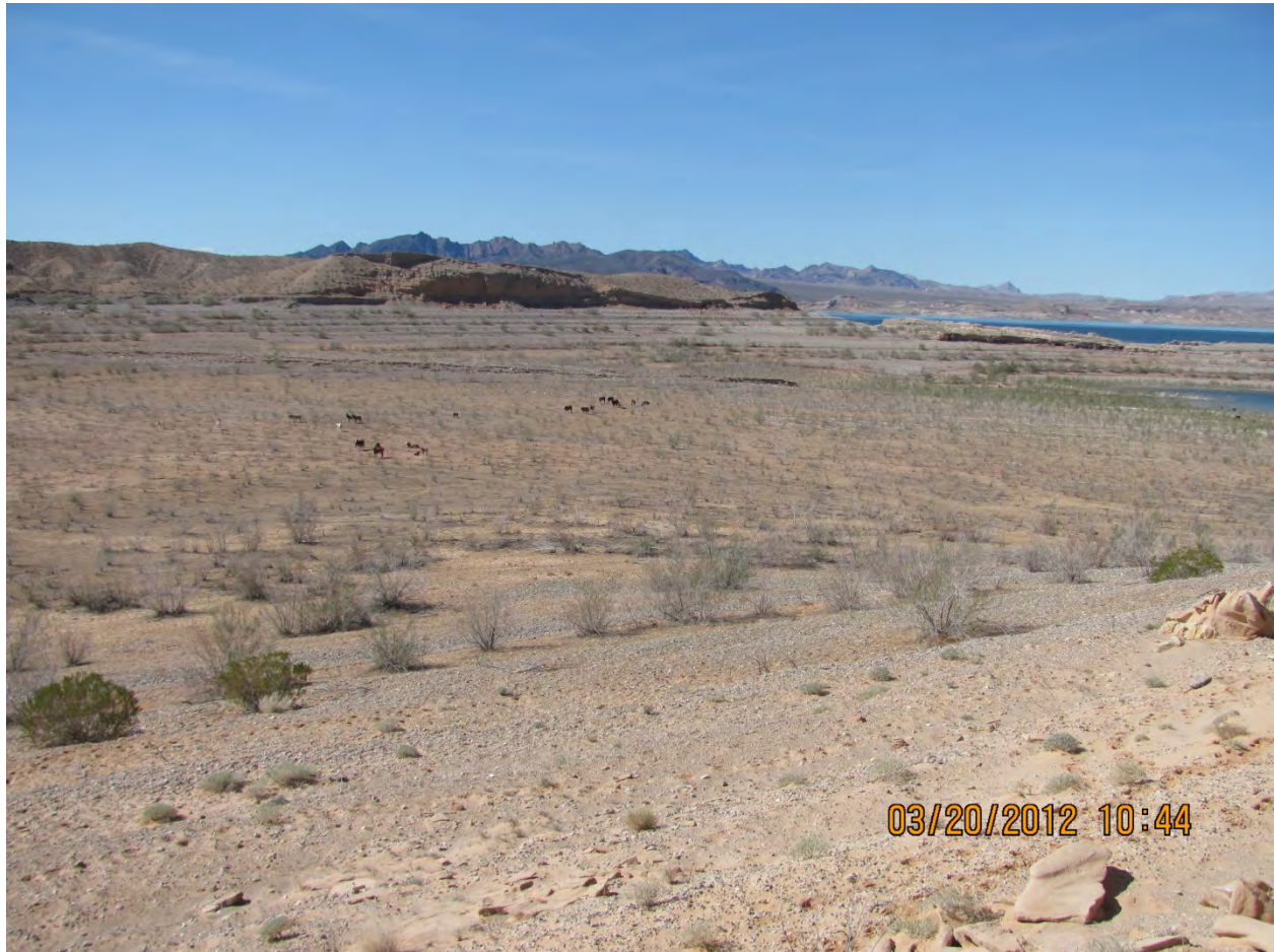
Figure 4. There were approximately 15-20 cattle in this area at Lime Cove.

The following 2 photos show the same herd of cattle just at different times (10:44 am and 9:43 am).