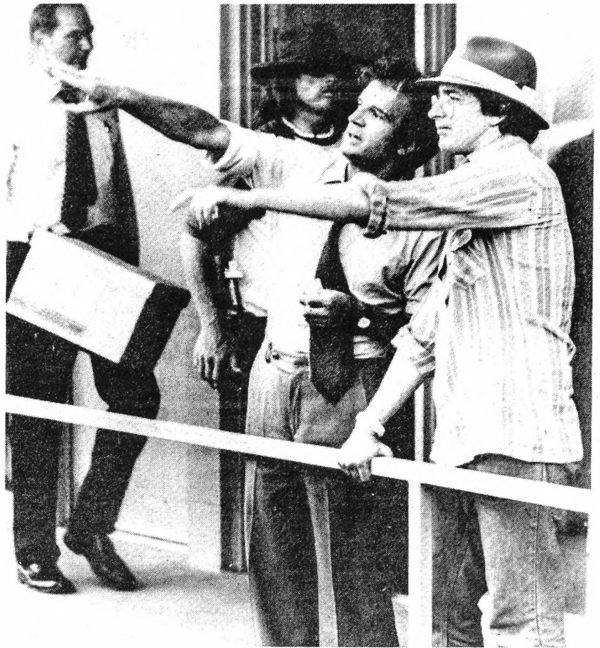
Who's directing who? The two 'directors' — Francois Truffaut and Steven Spielberg.

There is something going on which many governments in the world feel that people should not be made aware of yet. France and Brazil are the only two countries whose governments have