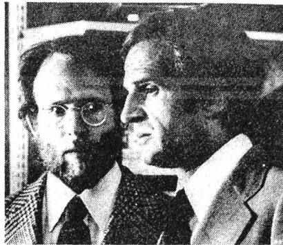
Francois Truffaut as the French scientist, Claude Lacombe, and Bob Balaban as his interpreter. Close Encounters of the Third Kind .

up of the film were you more in doubt than not?