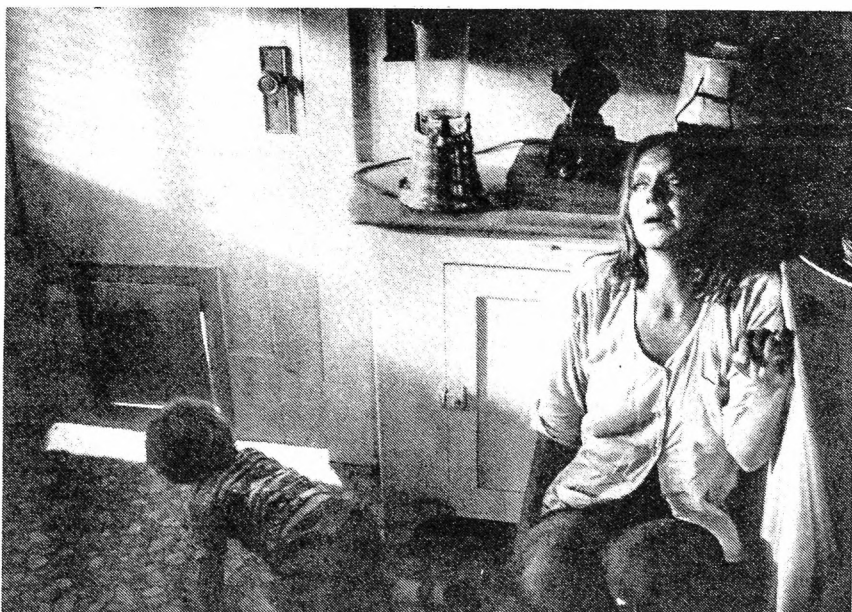
The child (Gary Guffey) drawn on by a strange glow in the sky. Close Encounters of the Third Kind .

I always consider the international market when I make a film. It was obvious to me that I would discuss the film more overseas than in the U.S. In the U.S. I merely discussed the flashiness and the sound, the excitement, the phenomena. Here in Europe I am discussing the story and the philosophy; the symbolism.