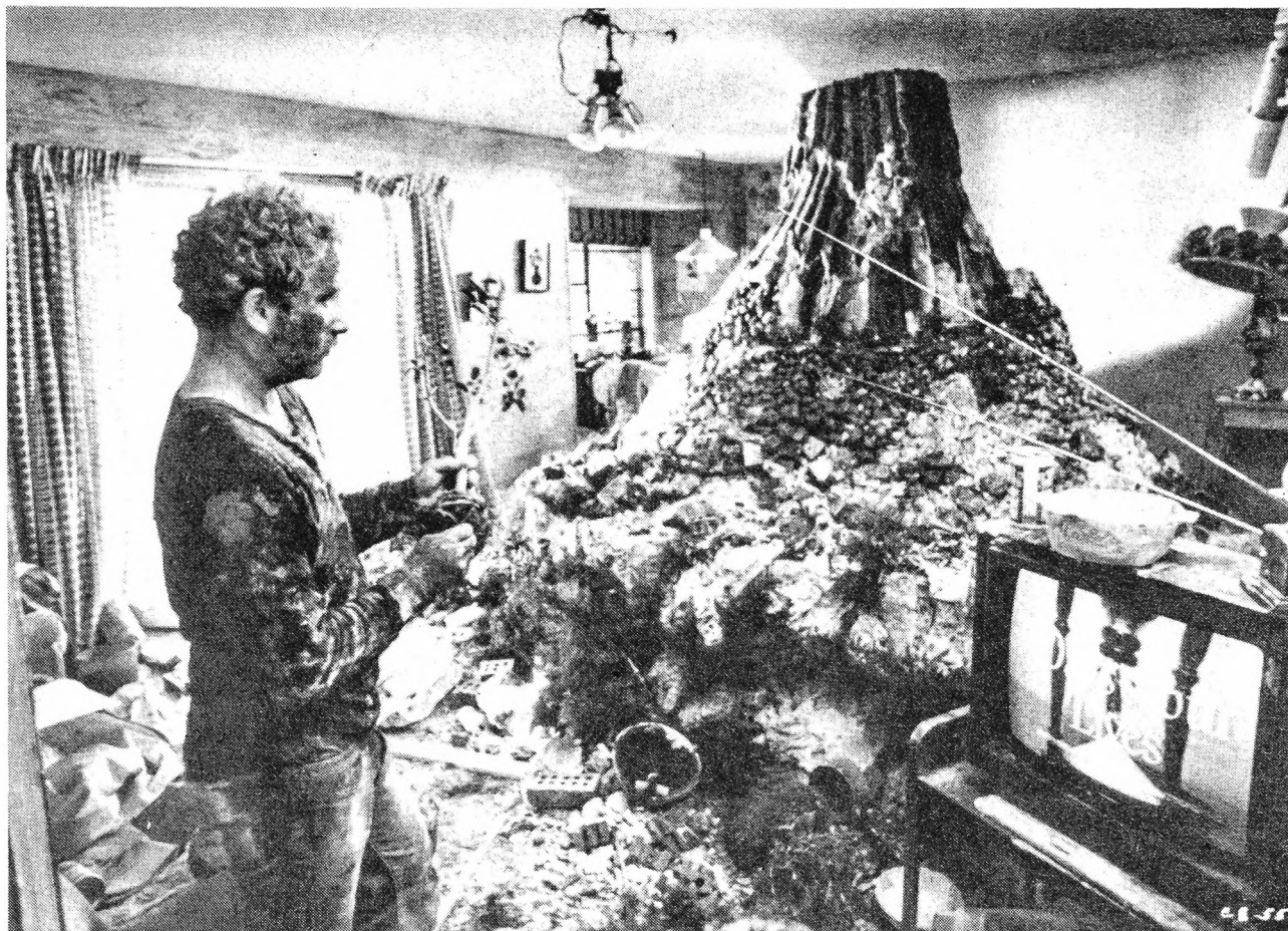
Driven by a nightmare he doesn't comprehend, Roy Neary (Richard Dreyfuss) recreates the Devil's Tower, Wyoming. Close Encounters of the Third Kind .