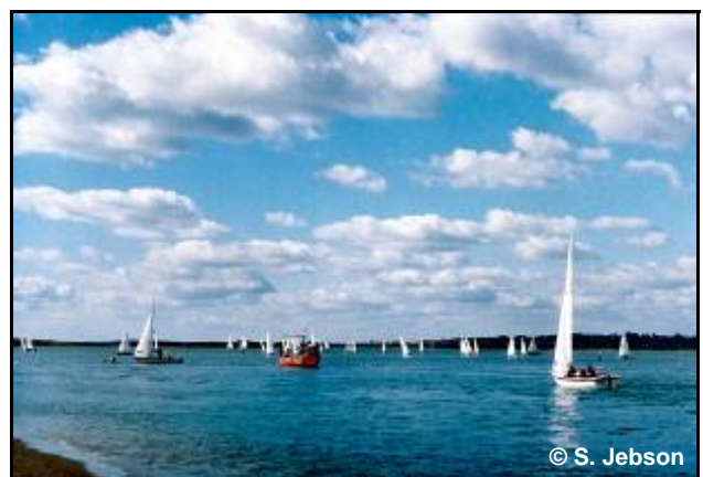
Figure 17. Cumulus humilis .