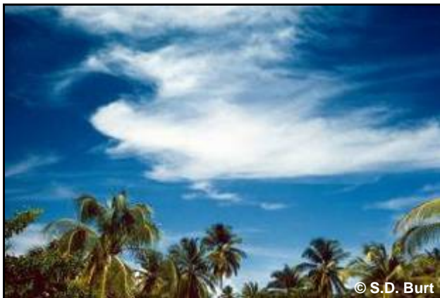
Figure 38. Cirrus spissatus .