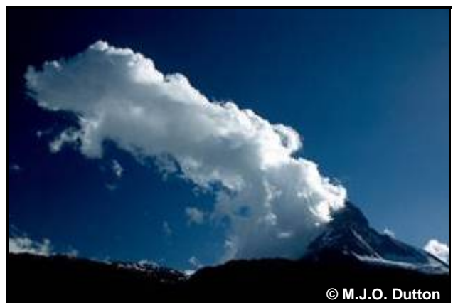
Figure 54. Orographic cloud, Matterhorn.