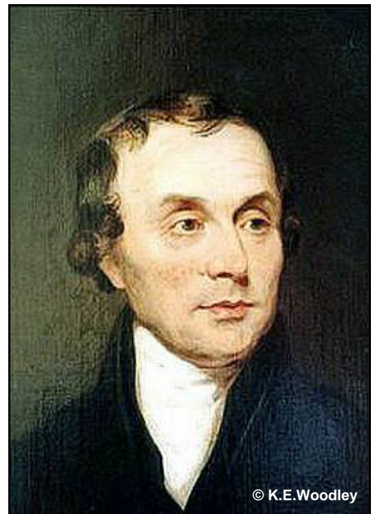
Figure 1. Luke Howard (1772 - 1864).

A new International Cloud Atlas was published in two volumes in 1956 by the World Meteorological Organization (WMO).