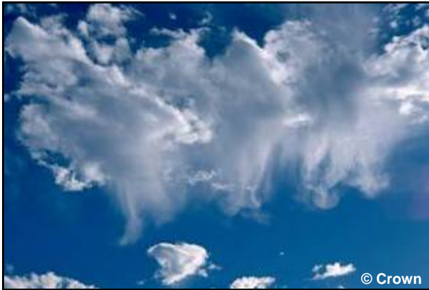
Figure 41. Virga.

Cloud column or inverted cloud cone (funnel cloud) protruding from a cloud base; it constitutes the cloudy manifestation of a more or less intense vortex. This supplementary feature occurs with cumulonimbus and, less often, with cumulus. The diameter of the cloud column, which is normally of the order of 10 metres, may in certain regions occasionally reach some hundreds of metres.