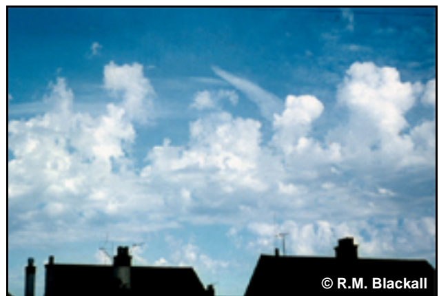
Figure 13. Stratocumulus castellanus .