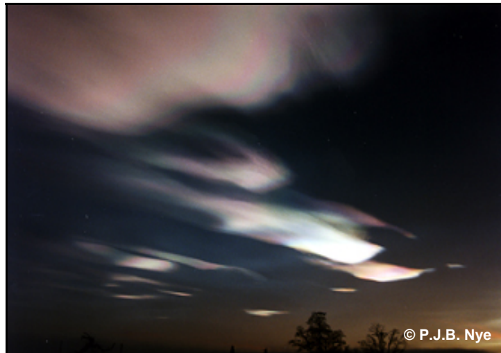
Figure 50. Nacreous Cloud.