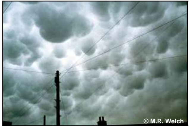
Figure 42. Mamma.