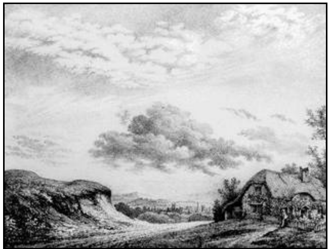
Figure 5. Cumulus breaking up, cirrus and cirrocumulus above.