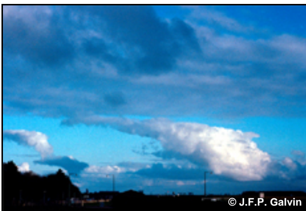
Figure 12. Stratocumulus cumulogenitus .