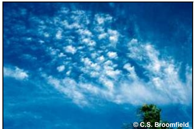
Figure 39. Cirrus floccus .