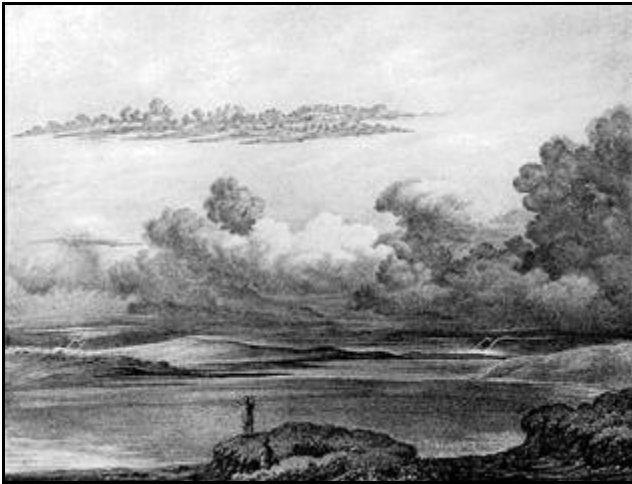
Figure 2. Forms assumed by clouds when gathering for a thunderstorm.

Below are examples of some of the illustrations depicted in Luke Howard's book entitled The Modification of Clouds .