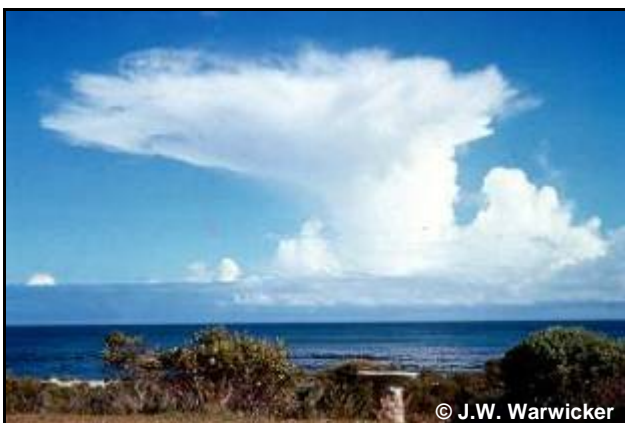
Figure 45. Incus.