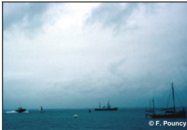
Figure 24. Nimbostratus.