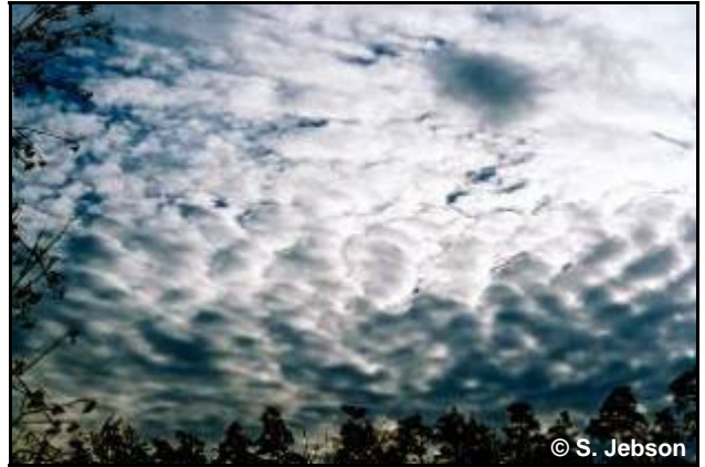
Figure 26. Altocumulus stratiformis .