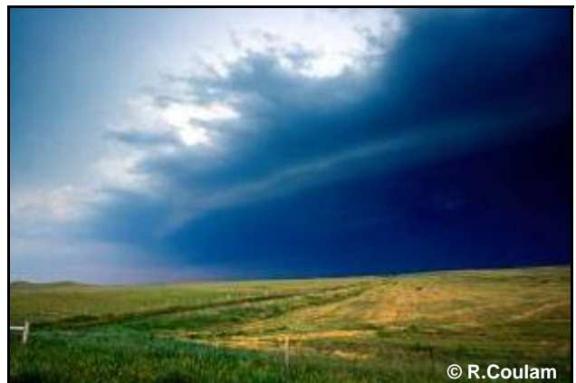
Figure 44. Arcus.