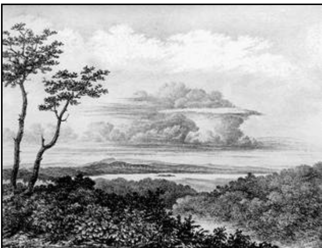
Figure 6. Cumulostratus as produced by the inoculation of cumulus with cirrostratus. Cirrus above, passing to cirrocumulus.