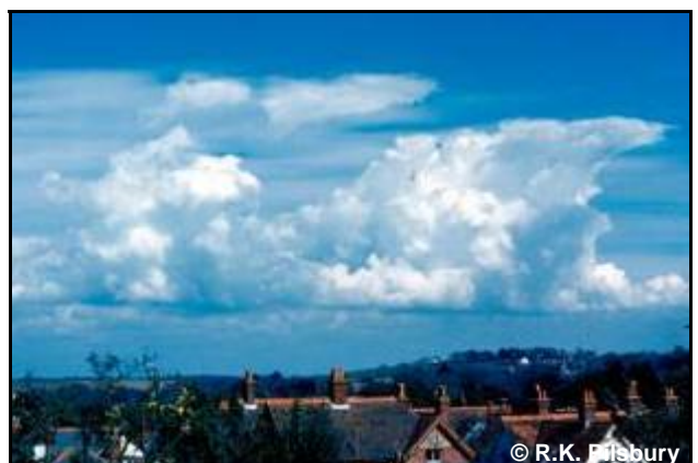
Figure 30. Altocumulus cumulogenitus .