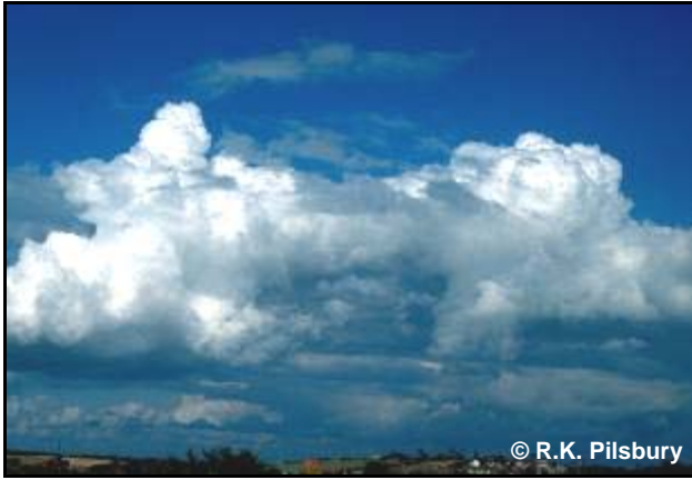
Figure 18. Cumulus mediocris .