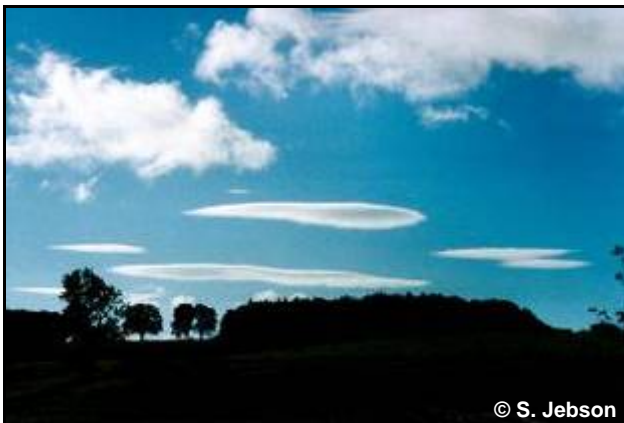
Figure 27. Altocumulus lenticularis .