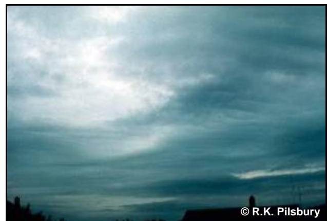
Figure 23. Altostratus opacus .