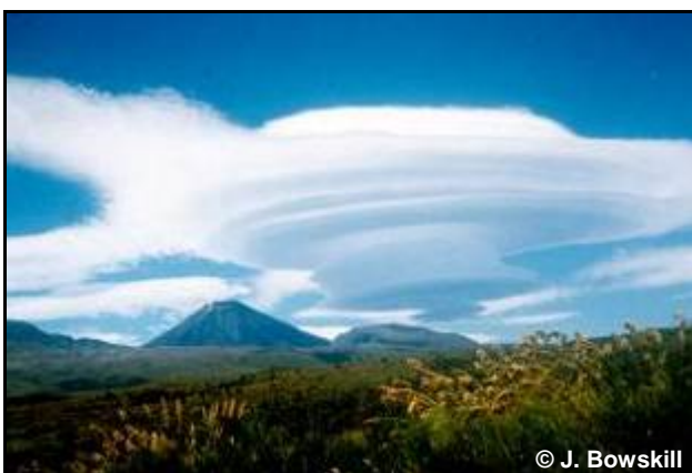
Figure 53. Orographic cloud, Mount Ruapahu, New Zealand.

Cloud which is formed by forced uplift of air over high ground. The reduction of pressure within the rising air mass produces adiabatic cooling and, if the air is sufficiently moist, condensation. Lenticular wave clouds, including those formed well to leeward of the high ground, are common orographic clouds; stratus, cumulus and cirrus clouds are also sometimes orographic in origin.