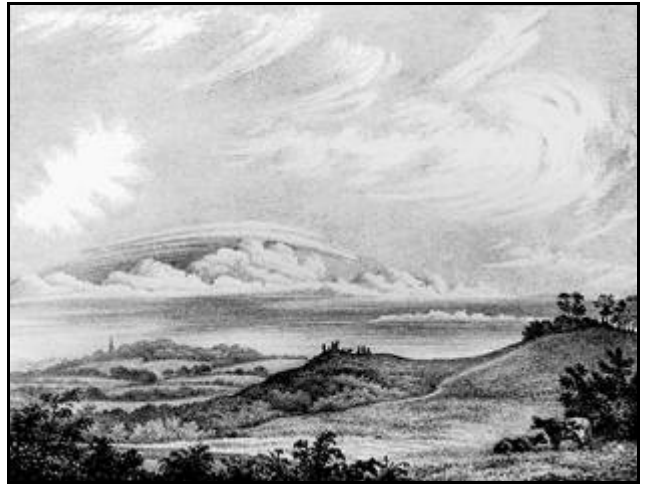
Figure 3. Cumulostratus forming, fine weather cirrus above.