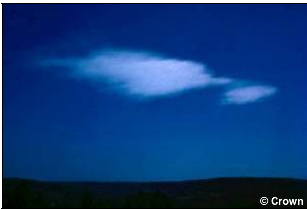
Figure 34. Cirrocumulus lenticularis .