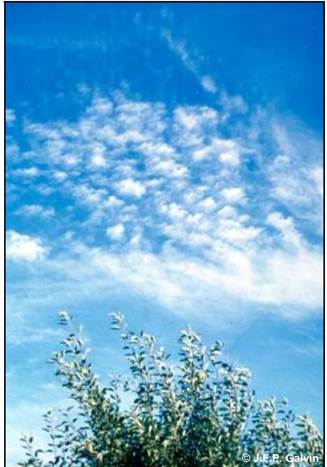
Figure 35. Cirrocumulus floccus .