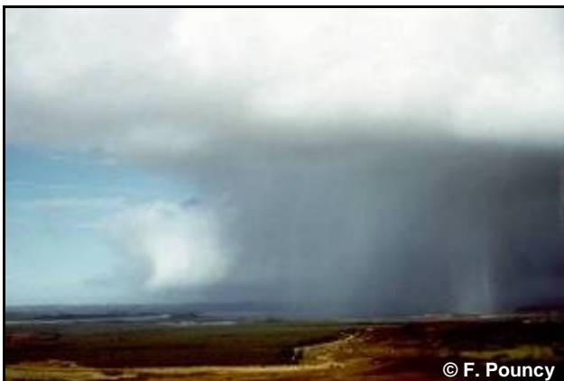
Figure 43. Praecipitatio.