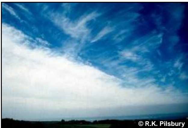
Figure 31. Cirrostratus nebulosus .