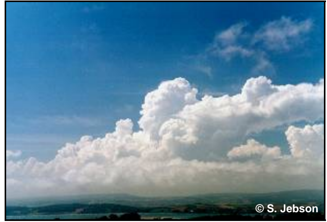
Figure 19. Cumulus congestus .