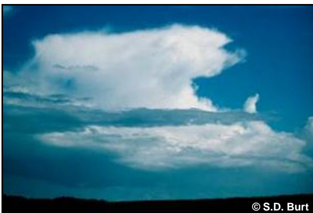
Figure 49. Velum.