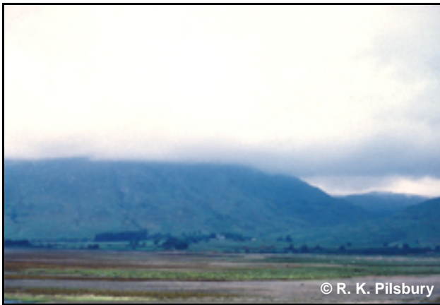
Figure 10. Stratus nebulosus .