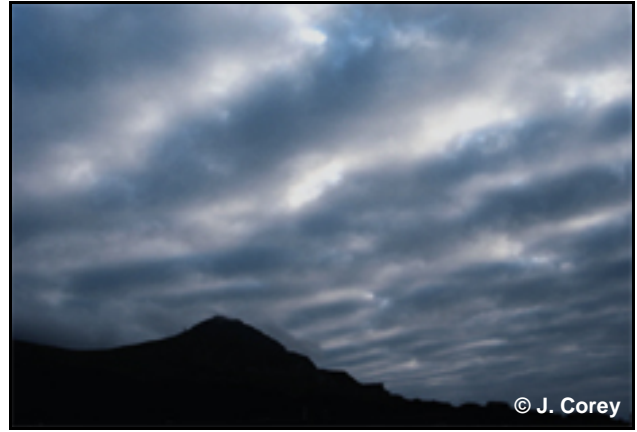
Figure 15. Stratocumulus stratiformis .