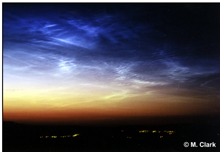
Figure 51. Noctilucent Cloud.

Noctilucent clouds usually appear in the form of thin cirrus-like streaks, sometimes only one or two isolated filaments being visible while at other times the cloud elements are closely compacted into an almost continuous mass resembling cirrocumulus or altocumulus. Noctilucent clouds can usually be distinguished from ordinary clouds by the fact that they remain brighter than the sky background and glow with a pearly, silvery light, generally showing tinges of blue colouration.