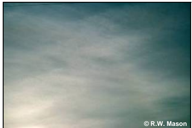
Figure 32. Cirrostratus fibratus .