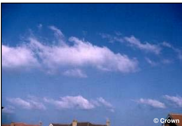
Figure 16. Cumulus fractus .