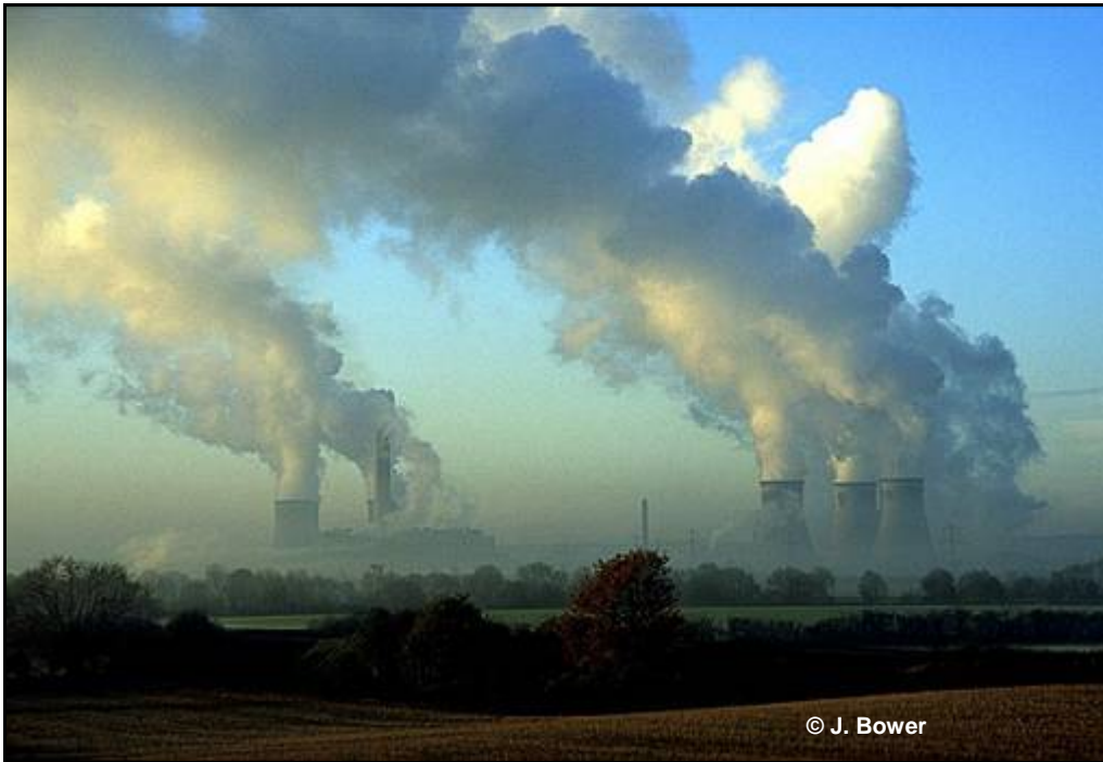
Figure 52. Pyrocumulus forming over Didcot Power Station, Oxfordshire.

A term sometimes given to the cumulus cloud that forms over an intense source of heat on the ground, such as a power station or a heath or forest fire. It does not form part of the official WMO cloud classification and is, in any case, an unhappy mixture of Greek and Latin.