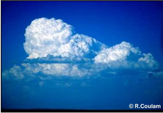
Figure 20. Cumulonimbus calvus .