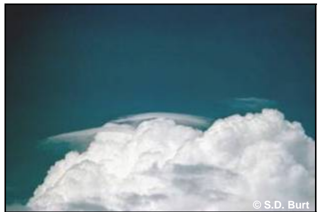
Figure 48. Pileus.