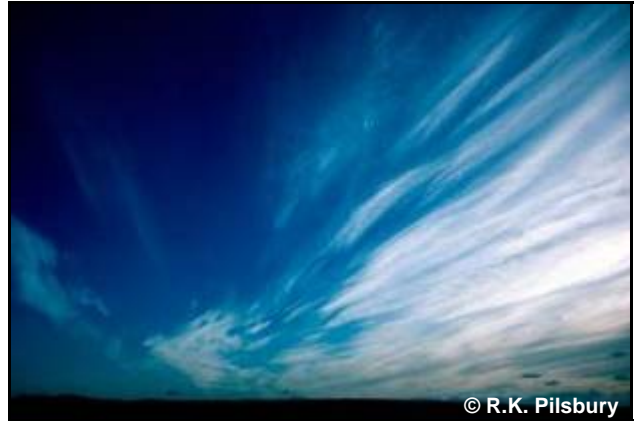
Figure 37. Cirrus fibratus .