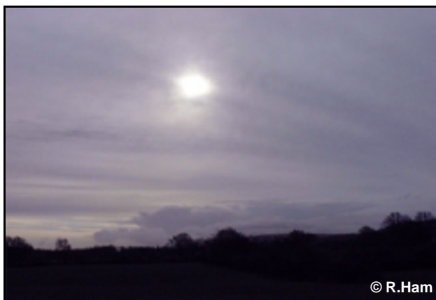
Figure 22. Altostratus translucidus .