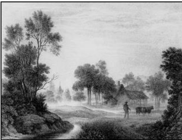
Figure 4. Stratus or ground fog.