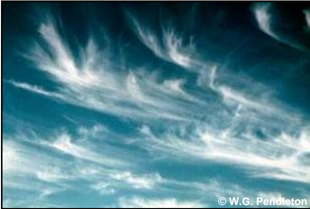
Figure 36. Cirrus uncinus .