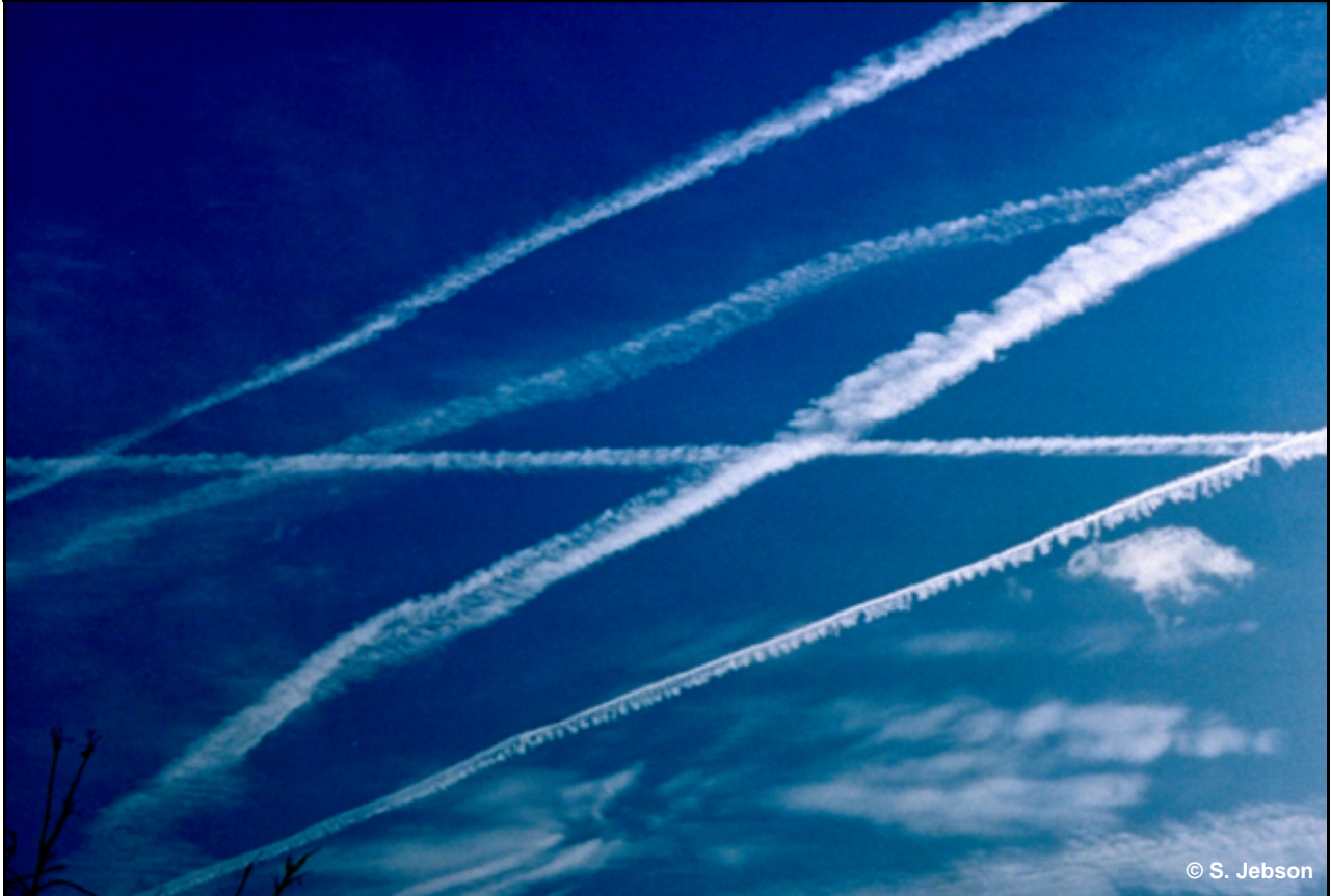
Figure 55. Contrails.

An initially thin trail of water droplets or ice crystals produced by an aircraft engine exhaust when the humidifying effect of the water vapour exceeds the opposed heating effect of the exhaust air (exhaust trail). Such trails generally broaden rapidly and evaporate as mixing with drier air proceeds; when the atmosphere is already moist, however, they may be very persistent.