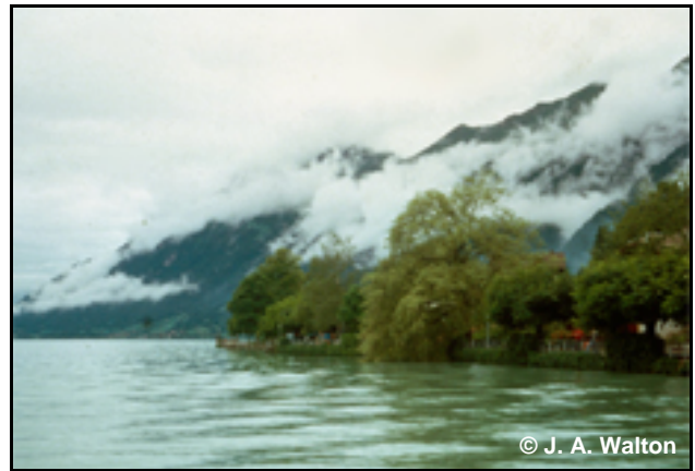
Figure 11. Stratus fractus .