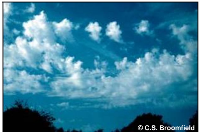
Figure 28. Altocumulus castellanus .