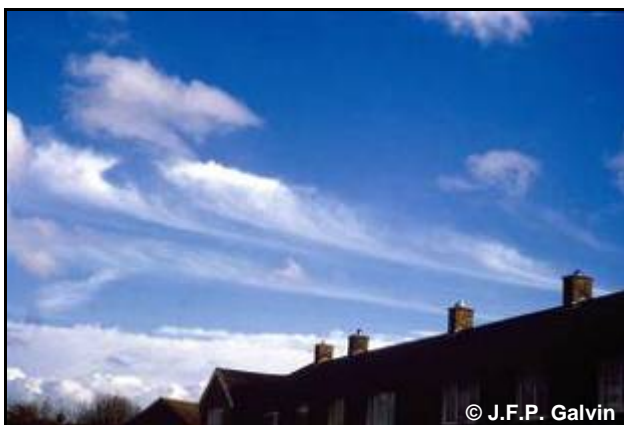
Figure 40. Cirrus castellanus .