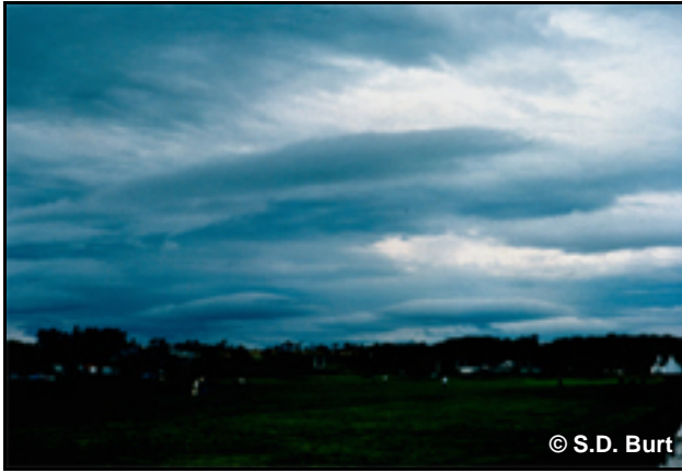
Figure 14. Stratocumulus lenticularis .