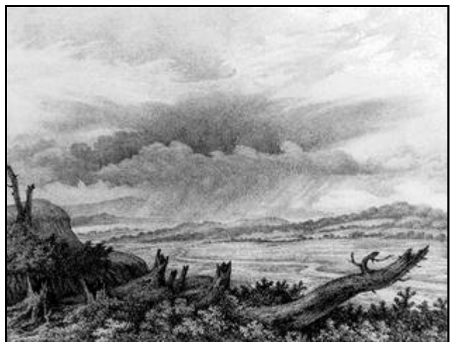
Figure 7. Nimbus or rain cloud.