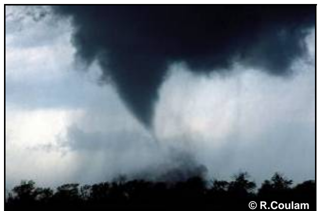
Figure 46. Tuba.