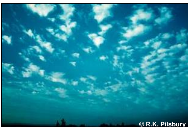
Figure 29. Altocumulus floccus .