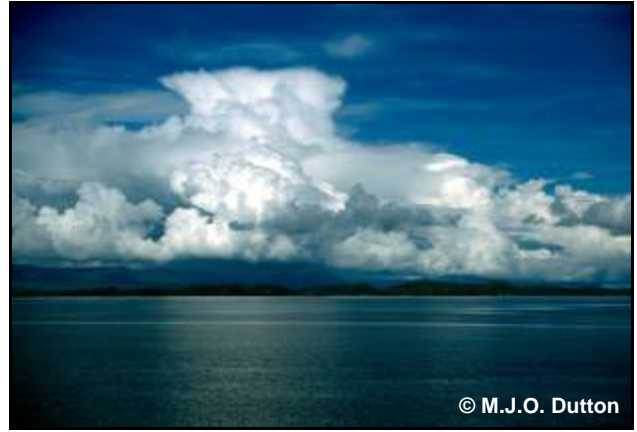
Figure 21. Cumulonimbus capillatus .