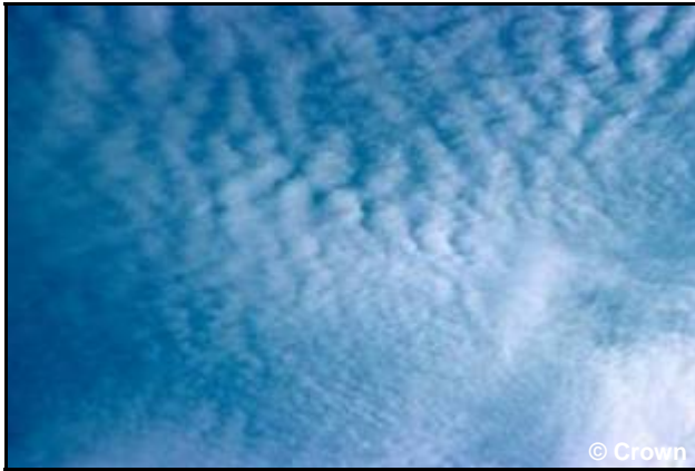
Figure 33. Cirrocumulus stratiformis .