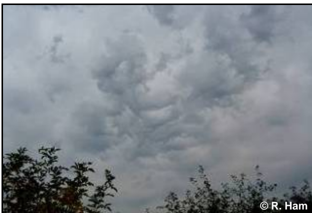
Figure 47. Pannus.

An accessory cloud veil of great horizontal extent, close above or attached to the upper part of one or several cumuliform clouds which often pierce it. Velum occurs principally with cumulus and cumulonimbus.