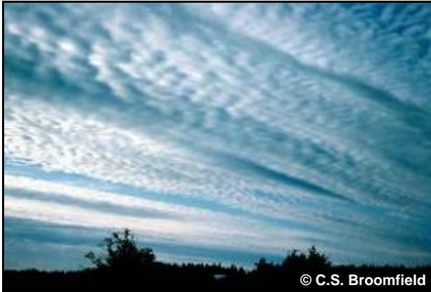
Figure 25. Altocumulus stratiformis .