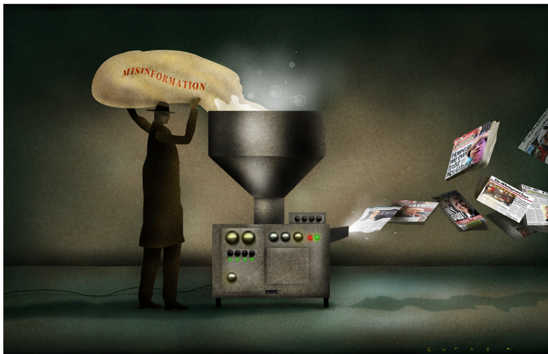
Fig. 1. Fabricated social media posts have lured millions of users into sharing provocative lies. Image courtesy of Dave Cutler (artist).

Social media users were also being targeted by Russian dysinformatyeva : phony stories and advertisements